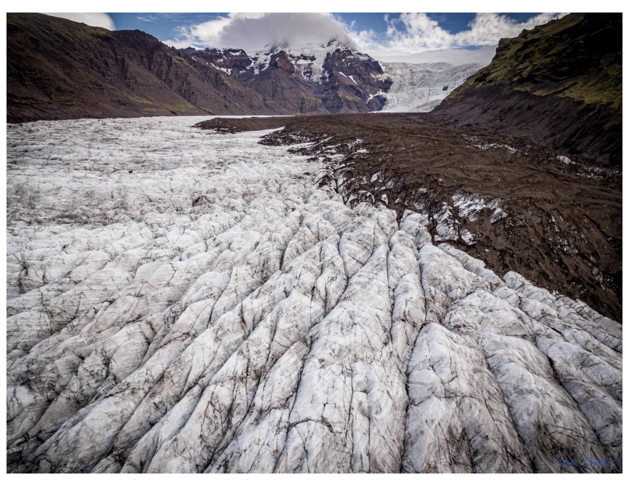
Fig. 2. Drone image of landslide on Svínafellsjökull, Iceland.

For more information, please get in touch with Marek Ewertowski (evert@amu.edu.pl)